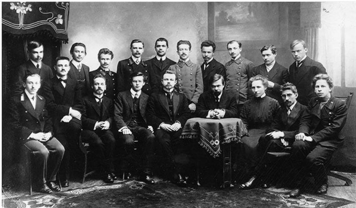
A group of physicists-employees of P.N. Lebedev laboratory (Source: V L Ginzburg, Physics-Uspekhi 2009, 52(6), c 531)

P.N. Lebedev (1866-1912) Professor of Moscow University, the head of the physical laboratory and the skilled experimenter, was the founder of the first scientific physical school in Russia.