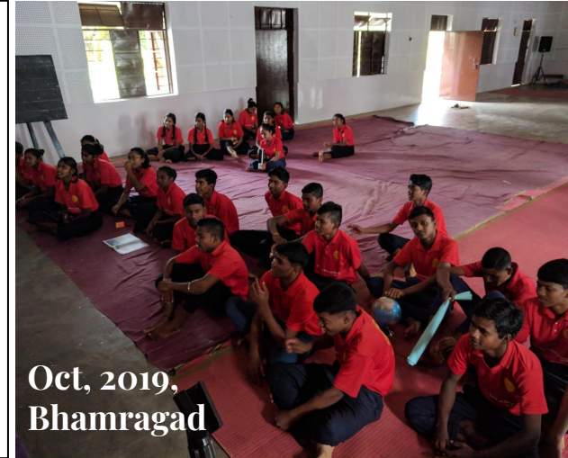
Oct, 2019, Bhamragad