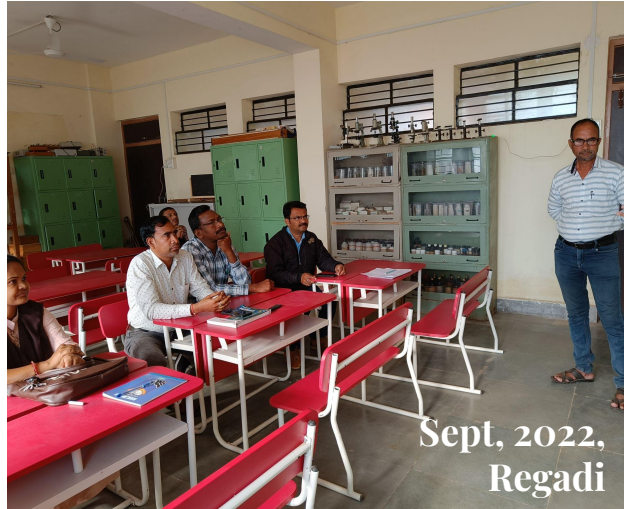
Sept, 2022, Regadi