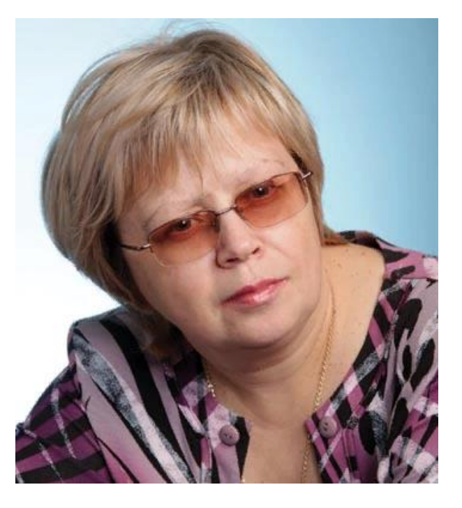
Kotelnikov Institute of Radioengineering and Electronics of RAS