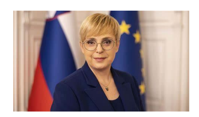
The 1<sup>st</sup> female president of Republic Slovenia (2022): Dr. Nataša Pirc Musar