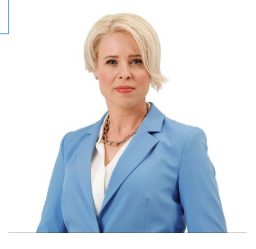
The 1<sup>st</sup> female president of Slovenian Parliament (2022): Urška Klakovčar Zupančič, MSc.