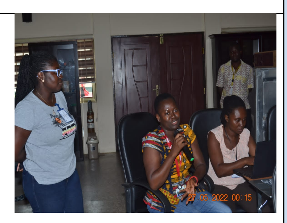
Fig 2: Women Empowerment Program by Women in Physics