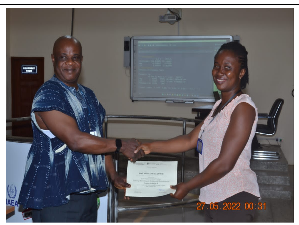
Fig 3: Women Empowerment Program