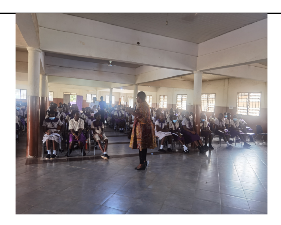
Fig 1: Mentorship Program by WiN Ghana